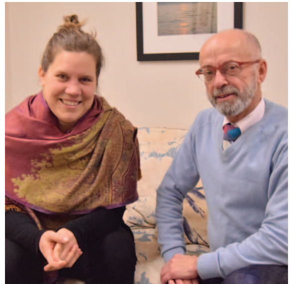
Relaxing in the ECUT office at Knox College.